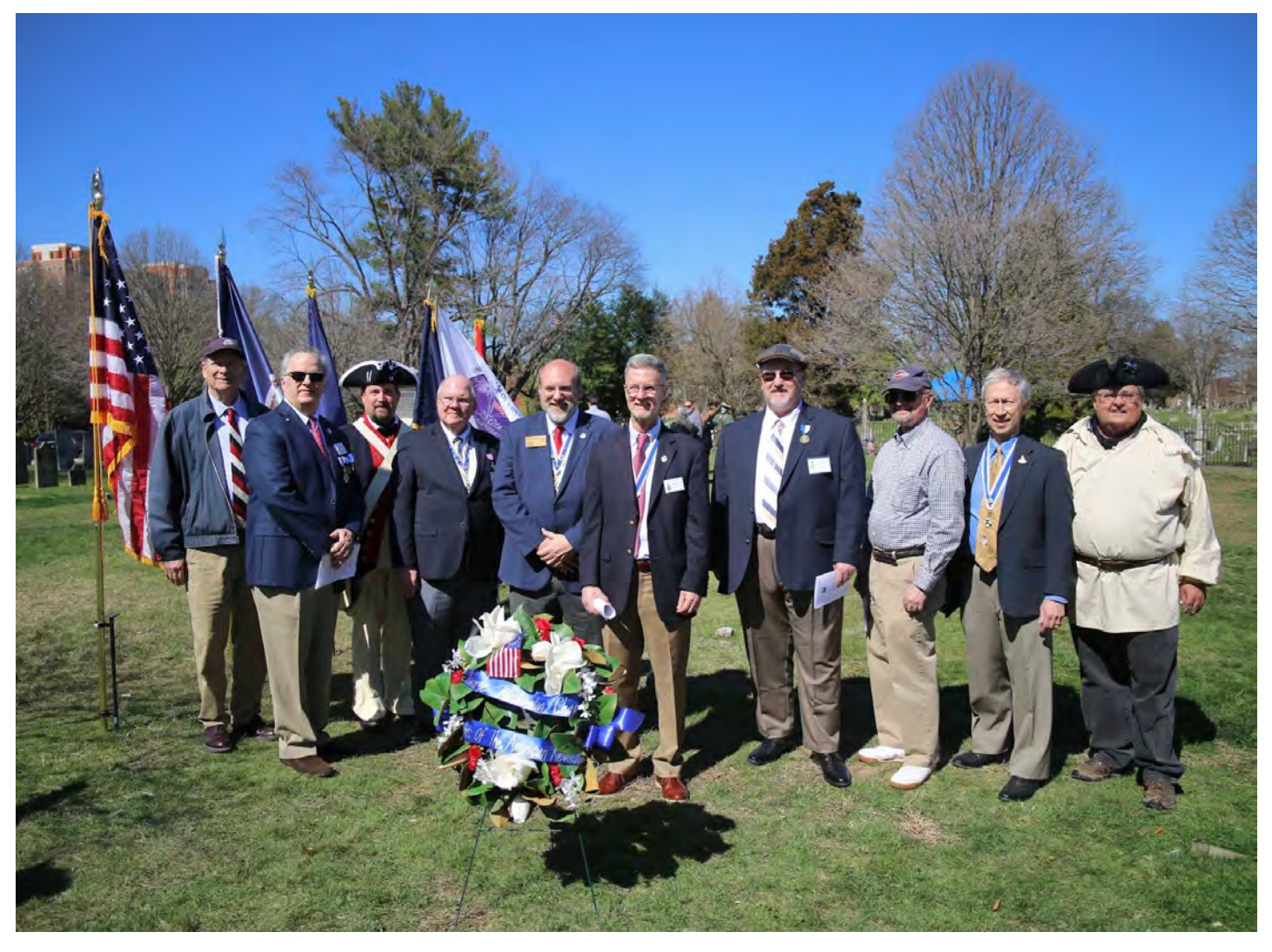
Page 6 ~ George Washington Chapter Sons of the American Revolution ~ Alexandria, Virginia

LEFT: Two of the plaques placed by the Chapter. BELOW: Compatriots of the George Washington Chapter after the wreath-laying.