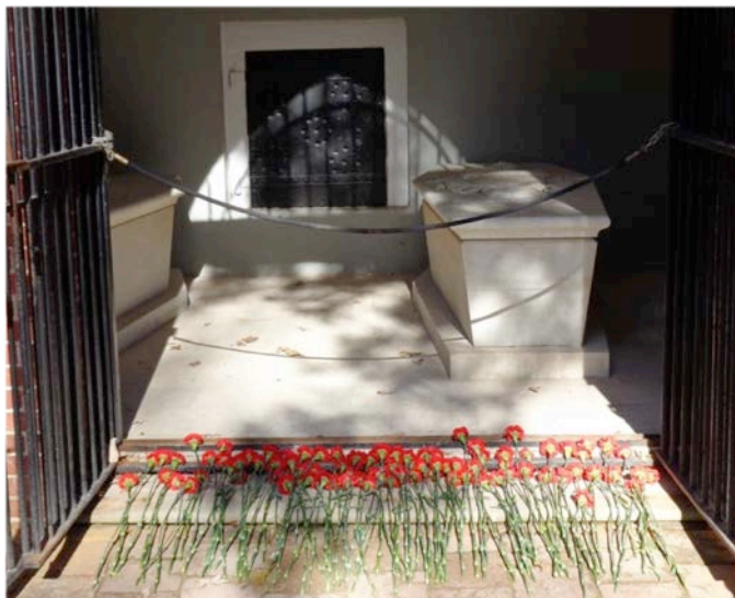
General Washington's Tomb on Veterans' Day.