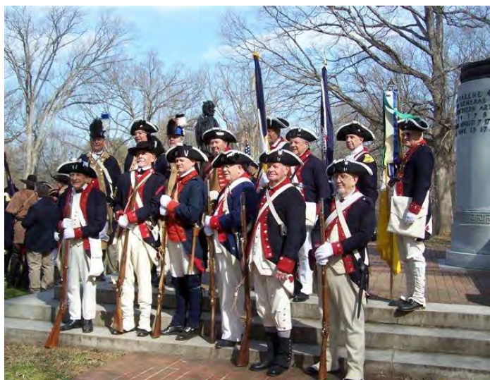
The Color Guard at Guilford Courthouse, March 7, 2013.

Please give this your consideration and help us with this campaign today !