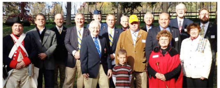
Veterans' Day Ceremony at Mount Vernon

The George Washington Chapter was chartered in its present form on April 2, 1954. With over 250 members, it is Virginia's largest SAR chapter. Meetings are held at 11:30a.m. on the second Saturday of each month (June, July & August excepted) at the Belle Haven Country Club, 6023 Fort Hunt Road, Alexandria, Virginia.