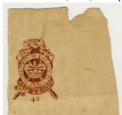
One of thirty-two surviving "red proofs" of the 1765 Stamp Act revenue stamps that led to protests against "taxation without representation."

In September 2013, the Smithsonian National Postal Museum (NPM) will open the world's largest