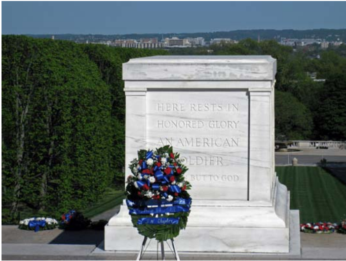
Our wreath at the Tomb.

Here rests in honored glory an American soldier known only to God.