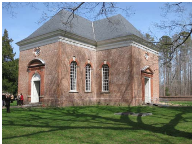
Historic Christ Church, Irvington, Virginia