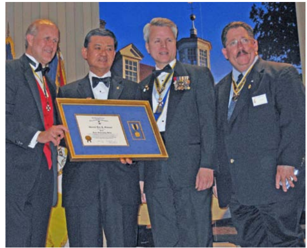
General Shinseki receives the SAR Gold Good Citizenship Medal

He concluded with a discussion of his present responsibilities as the Secretary of Veterans Affairs and the important goals he has established for the organization. He spoke of his special concern for