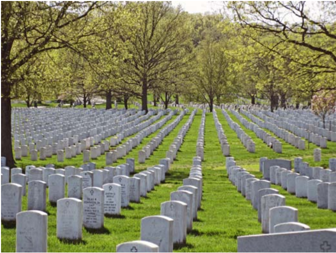
April 10, 2010. Section 60, Arlington National Cemetery, where many of the fallen from Iraq and Afghanistan rest.

Our group then proceeded to the Tomb of the Unknowns where we were met by many other compatriots and SAR Color Guardsmen for a wreath-laying ceremony. Our ceremony was one of about 25 that were conducted that day. The stairs leading to the Tomb plaza were crowded to capacity for the 4 o'clock changing of the guard. We were scheduled for 4:15, and as that time approached, the SAR Color Guardsmen formed on each side of the aisle on the stairs leading down to the Tomb plaza.